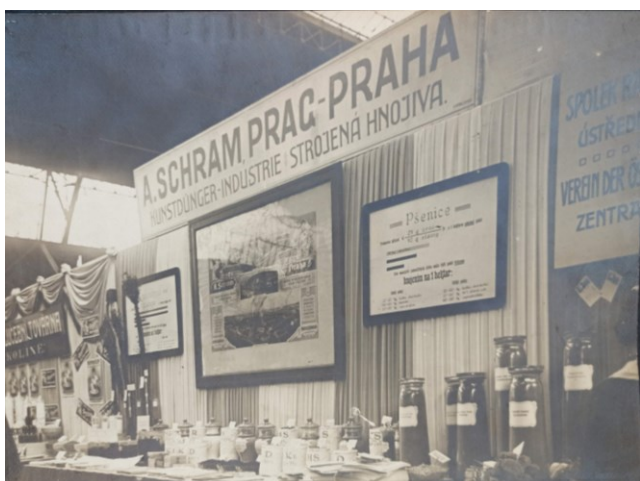
Fig. 4. The exhibition stand of the firm A. Schram during the trade fair in Prague in 1925. [19]

The second major media of the time most suitable to promote one’s business were the various agricultural and industrial trade shows. Additional benefit of attendance was the possibility of obtaining various diplomas or medals, which could be used to further promote product quality. First recorded participation of the firm A. Schram in such an event was during the agricultural fair in Bubeneč in 1875. [17] Although they grew ever more important towards the end of the 19 th century, after the nationalistic struggles that erupted during the 1891 General Land Centennial Exhibition in Prague, [18] it became increasingly difficult for firms to advertise to both Czech and German customers in the Bohemian Lands. As an ethnically German firm, A. Schram tried not to overemphasize its language and ethnic identity, especially since most of its customers were ethnically Czech.