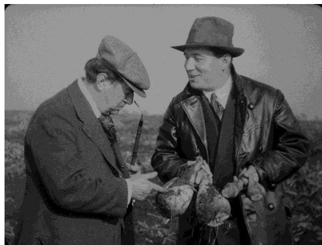
Fig. 7. A scene from the movie Jinak otcové – jinak děti . A farmer shows his sugar beet harvest to his father. [27]

Out of the dozens of movies produced a single one was selected to analyze, called Jinak otcové – jinak děti . The plot revolves around a small farmer Jeník, who is too poor to marry his loved one. He eventually goes on to study agronomy in Prague, where he learns firsthand about the advantages of fertilization. When he comes back home, he asserts his new ways against his reserved father, eventually reaping rich harvest that earns him recognition and allows him to marry. [26] All in all, an almost tedious plot. However, its primary significance can be illustrated in figure 7, where Jeník shows his harvest – an emotional pressure on the viewer urging him not to end up humbled by meagre harvest like Jeník's father. In the end, it is the dawn of an advert capable of working with the psychology of the customer, well established in modern marketing, but a breakthrough at the time.